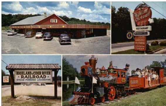
Postcard from SPS Archives

HIGHLAND ORCHARDS Hartford Ave., Rt. 6 to Rt. 101, No. Scituate, R. I. Telephone Niagara 7-3300 Home of the Famous apples that you can eat in the dark. Charcoal broiled foods served in a unique atmosphere. Your host, Clayton Brown The last steam locomotive gone??? No, not quite, there is one in Rhode Island, a scale model of old time railroading, the "Iwonda", a Baldwin type engine of 1875, built 3" to 1". Owned by Highland Orchards